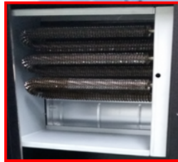
Electric Heater 15kW x 2